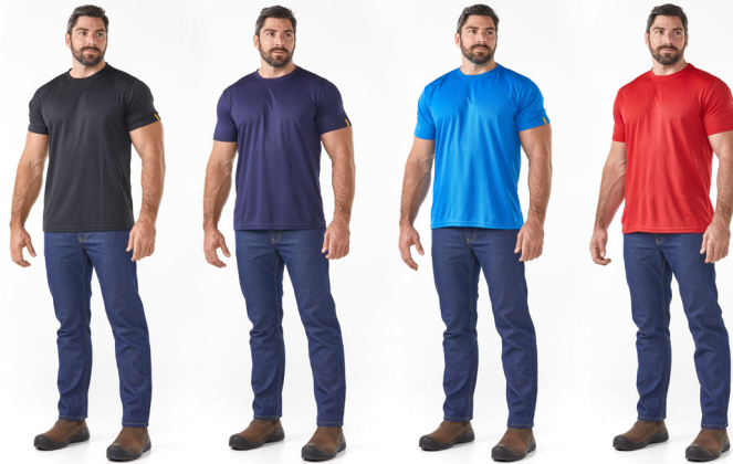
DW-TECH-TBK DW-TECH-TNB DW-TECH-TRB DW-TECH-TRD

Style: Crew neck, short sleeve t-shirt Fabric composition: 100% Polyester Mass: 140gsm